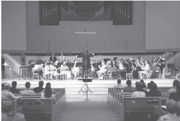
Sacred Winds Ensemble at the 2008 Baptist Church Music Conference National Convention First Baptist Church, New Orleans, LA.